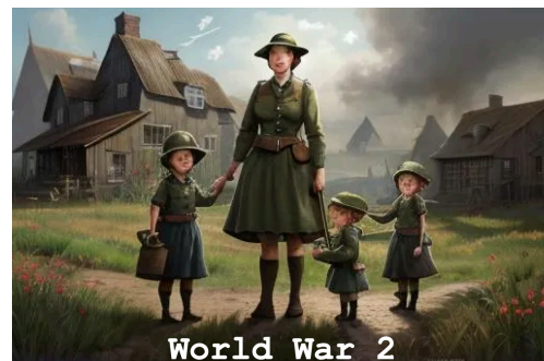
World War 2

TRY YOUR BEST SHOW RESPECT LEARN TOGETHER